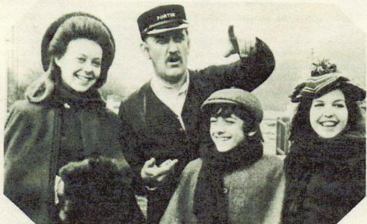
In the film THE RAILWAY CHILDREN , adapted from the book by E. Nesbit, Gary stars as Peter. Recognise the porter? It's Bernard Cribbins.

"I always wanted to be an actor," he said. "And I was lucky enough to land a small part as Pinocchio in the ITV programme Disney Wonderland when I was twelve. But it meant I had to have two days off school every week for rehearsals. Then I started getting parts in plays and in Z-Cars which meant I was getting about four full weeks off each term.